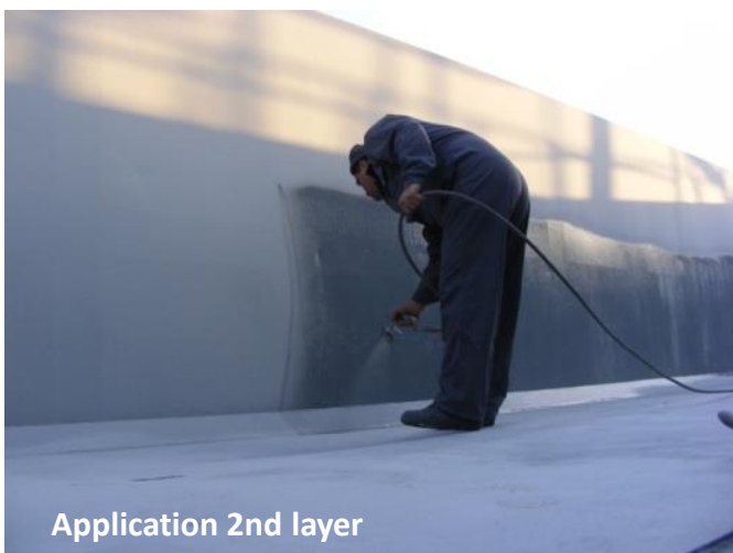
Application 2nd layer

On each of these 70 railway wagons 80 kg of ZINGA was consumed. 120 µm DFT in 2 coats of each 60 µm DFT were applied by airless spray gun by the contractor 'General Navorep'.