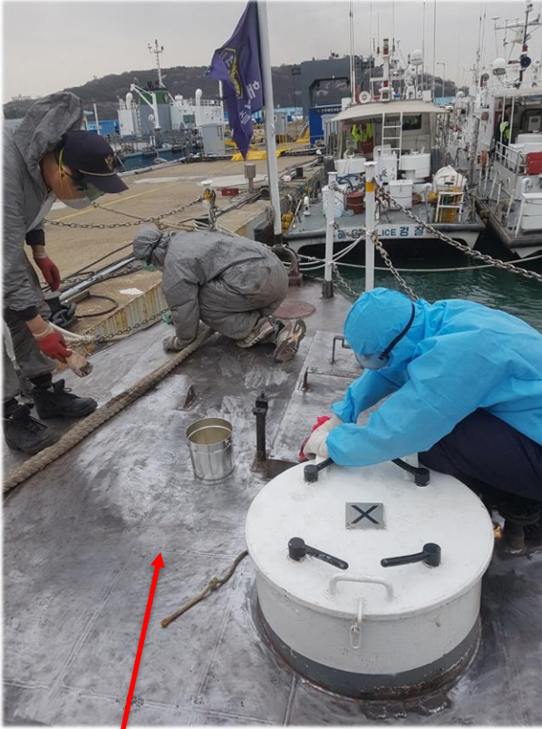
Application of ZINGA